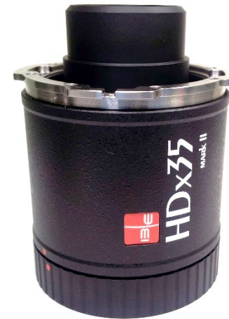
Adapter without PL extension