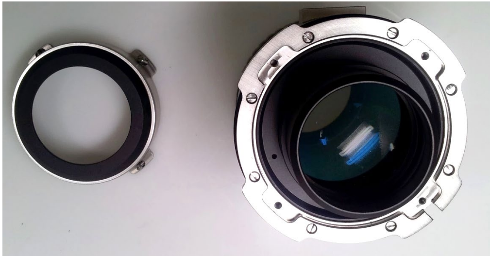
PL extension with screws