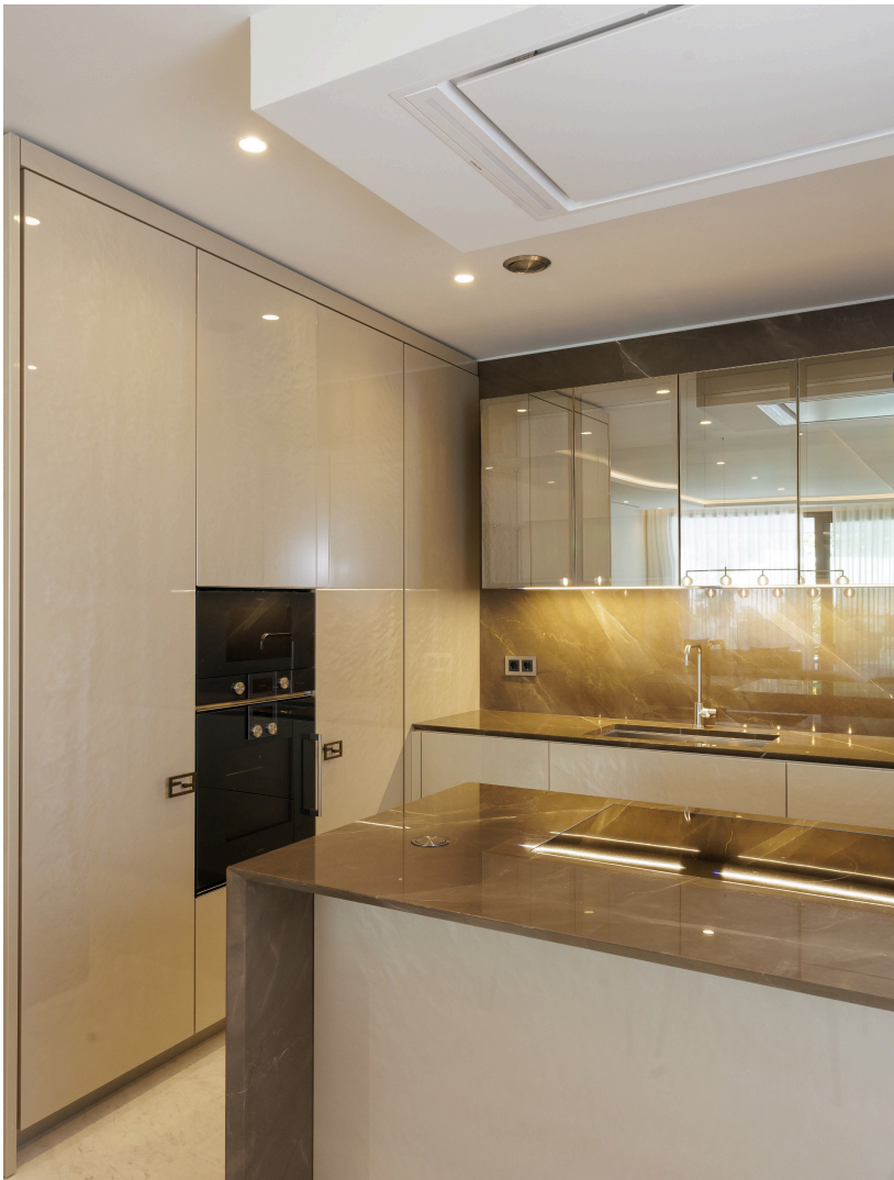
The property also includes 2 parking spaces and 1 storage room.