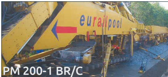
PM 200-1 BR/C